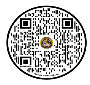
Scan Push Pay